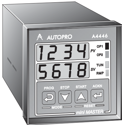
A4446 PID PROFILE CONTROLLER